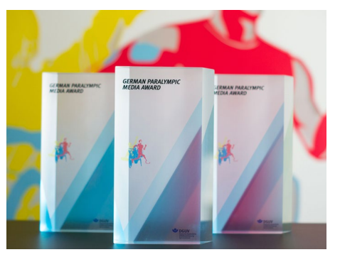
With the GPMA, the DGUV shows the important role sport plays in rehabilitation.

Enter now: .....} www.dguv.de > gpma (German only)