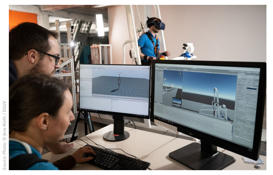
The ENTRAPon project funded by the German Social Accident Insurance aims to identify patterns in slipping and tripping accidents and use the data to make predictions.

When AI learns the desired behaviour from sample data, this can result in mistakes, which mirrors the process of human learning. The impacts are often non-critical, such as in the case of automated music recommendations. However, in the field of safety-relevant machine applications, a mistake could potentially pose a risk of injury or loss of life. Because of this, the German social accident insurance institutions are actively involved in developing safety concepts.