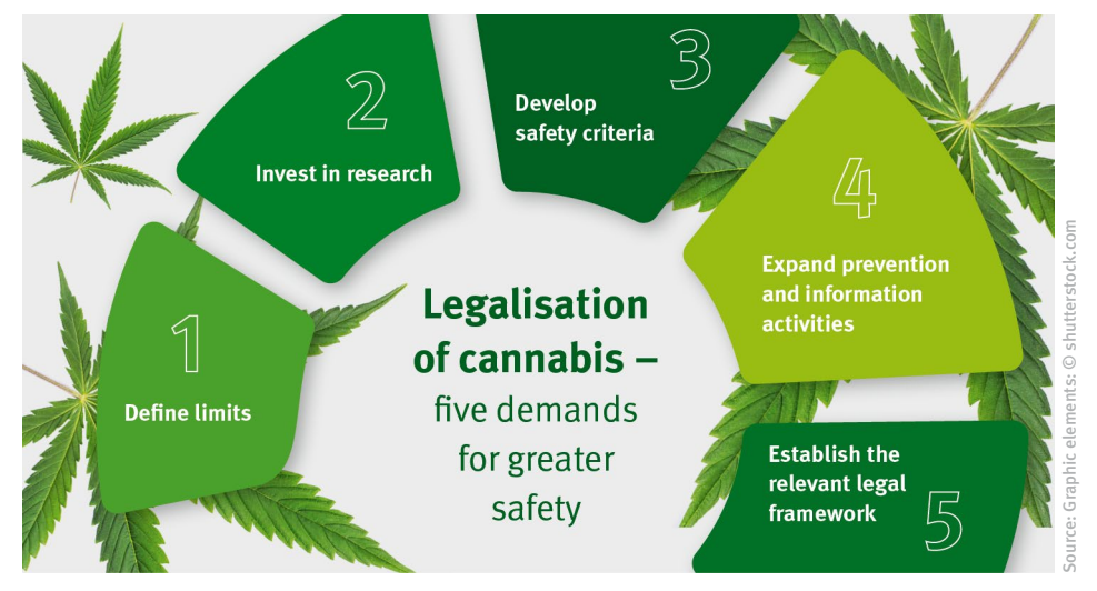
Five requirements set out by the German social accident insurance regarding the legalisation of cannabis.

In road traffic, there is a limit of 1 ng THC per ml of blood for cannabis. However, this only proves consumption and does not allow any conclusions to be drawn about a safety-relevant effect. The Verkehrsgerichtstag 2022 (German Traffic Court Conference) recommens raising the limit.