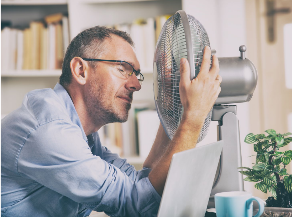
Heat can affect everyone, not just those working outdoors.

The effects can be seen in health consequences such as fatigue, lack of concentration, dehydration, but also depression or increased aggression. There are also economic consequences when people are less productive in hot weather or working hours are lost.