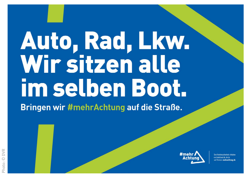
The road safety initiative #mehrAchtung (#MoreConsideration), which is supported by the DGUV and Germany's social accident insurance institutions, is calling for a more positive attitude on the road.