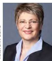
Gundula Roßbach President of the German Federal Pension Insurance

A single ESSN could help to avoid mistakes and delays. It is also conceivable to check insurance status electronically. At the moment, posted workers still use paper certificates to verify their social insurance coverage in their country of origin. There are many ideas for how to use an ESSN. However, existing insurance numbers cannot be replaced because they are a fixed element of national processes and procedures. It is important to us to make procedures efficient and customer-friendly. The Commission's initiative is an important launch pad.