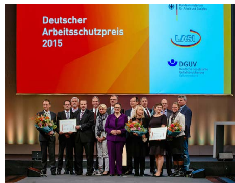
The 2015 award winners

Practical experience has shown that well-regulated occupational safety and health leads to a higher standard of quality in the workplace, to more productivity, to better performance and also to a higher degree of employee motivation. It pays for companies to invest effort into workplace prevention. The best examples of safety and health initiatives in the workplace, which serve as role models to inspire others, are awarded the German Occupational Safety and Health Prize (Deutscher Arbeitsschutzpreis: DASP) every two years. The bodies responsible for the DASP are the Federal Ministry of Labour and Social Affairs (BMAS), the Länder Committee for OSH and Safety Engineering (LASI) and the DGUV. Companies, individuals and institutions of