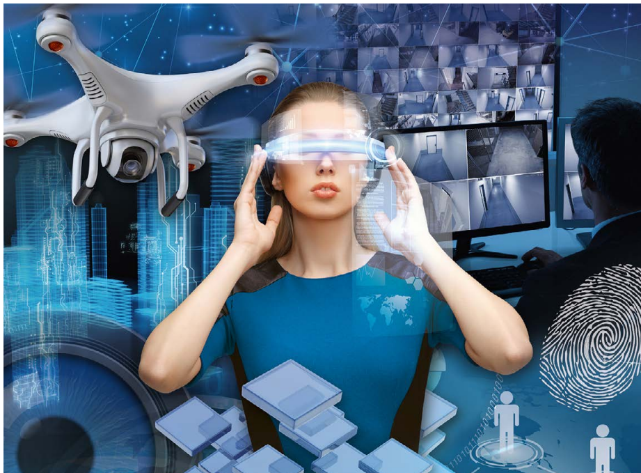
New developments are shaping an increasingly complex world of work

DGUV Risk Observatory identifies top ten trends