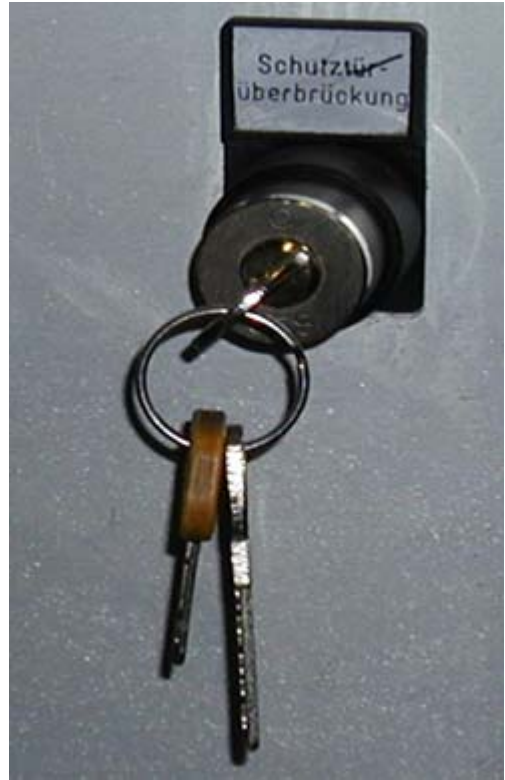
Figure 2: Defeating of a protective guard by key Label: "Bypass Protective Guard"