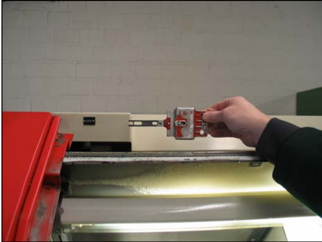
Figure 1: Defeating of a position switch on a protective guard of a machine