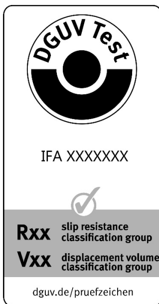
Figure 1: BGR/GUV-R 181

Providing the floor covering passes the type examination, a test certificate is issued (Figure 1). If desired and requested, a DGUV Test certificate authorizing use of the DGUV Test mark (Figure 2) may also be issued; in this case the form of marking must be agreed with the IFA, and a sample of the mark submitted for approval.