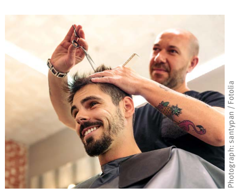
The focus is on small and micro enterprises

On 10 January, the European Commission launched a new initiative to improve the health and safety of workers. The initiative builds on current OSH regulations in the EU. The main focus is on three key objectives: first, help companies, particularly small and micro enterprises, to comply with OSH rules; second, modernise rules so they are easier to put into practice; and third, better protect workers against work-related cancers. To achieve the latter, the Commission intends to set exposure limits or other measures for an additional seven cancer-causing chemicals. To assist small and micro enterprises, a guide with practical tips for conducting a risk assessment has already been pub-