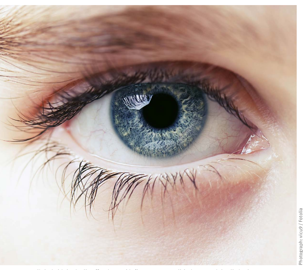
Every light is biologically effective and influences our well-being: special cells in the eye process light and stimulate the production of hormones in the body

manufacturing, in offices, during breaks and in first-aid rooms. KAN has taken a position on this.