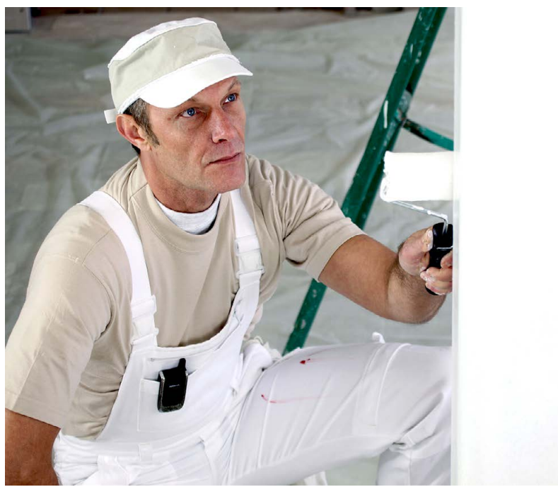
Nearly one in five employed tradespeople work more than 48 hours a week

BAuA Working Time Report: Overtime and weekend work is widespread