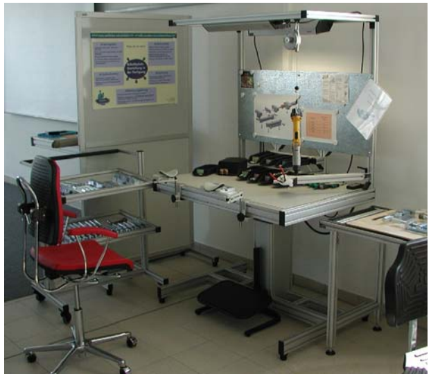
Age distribution in 2030 in Germany (top), Model workplace for older employees (below)