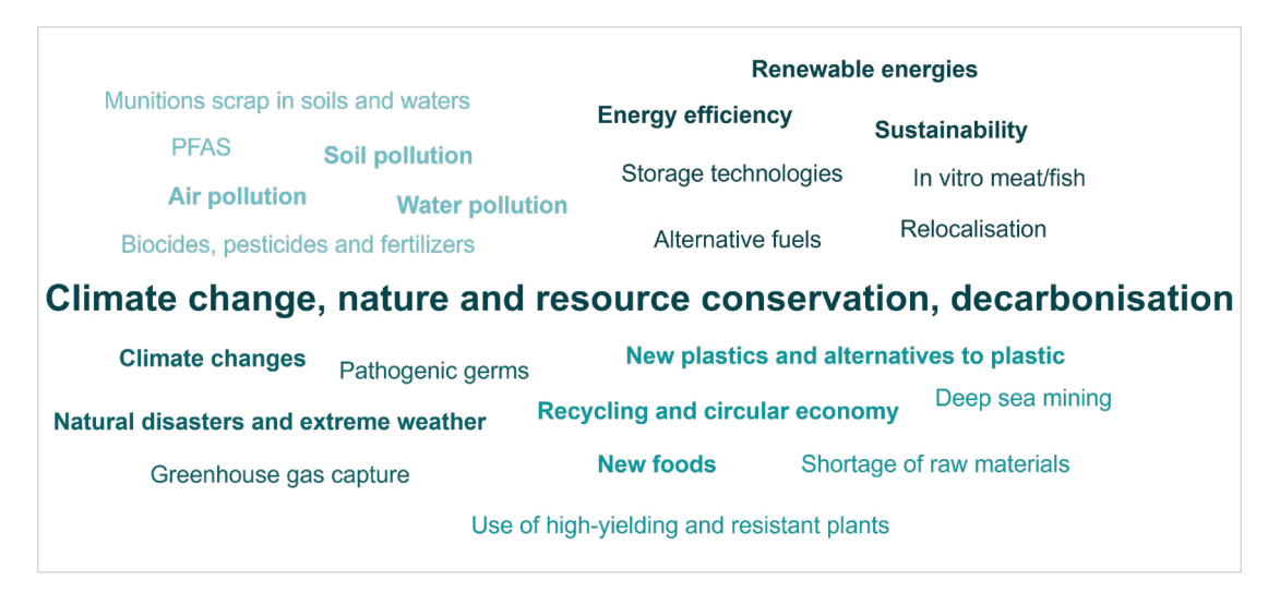
Figure 1: Word cloud global trend "climate change, nature and resource conservation, decarbonisation" with developments

The starting point of the risk observatory in each survey round are global trends and developments associated with them. The developments are specific manifestations of a global trend (cf. Figure 1 ). Therefore, each survey round of the risk observatory is preceded by the establishment of an inventory of current trends and developments from various sources (print and online).