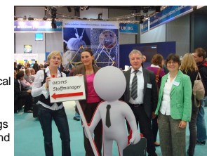
Promotion of the GESTIS-Stoffmanager at the A+A 2012