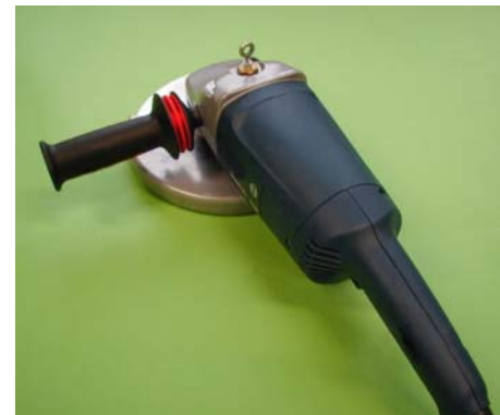
Figures: Schematic diagram showing the vibrating structure (left) vibration-attenuated auxiliary handle on an angle grinder (right)