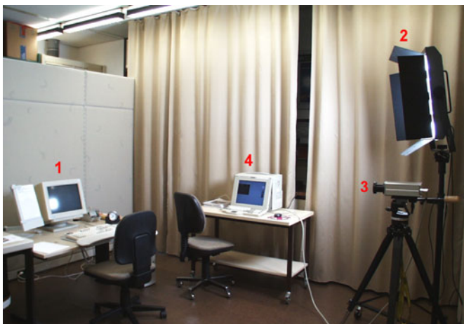
Illustration 1 Model video display terminal workplace

DIN EN ISO 9241-7 defines three classes of video display terminal in terms of their freedom from glare. The definition of the classes appears obsolete, however. Owing to technical progress, monitors of the poorest class, III/III, have disappeared almost completely from the market, and almost all modern flat screens satisfy the requirements of Class I/I. Stronger differentiation and adaptation of the requirements concerning unwanted luminance to the definition of the classes therefore appears necessary.