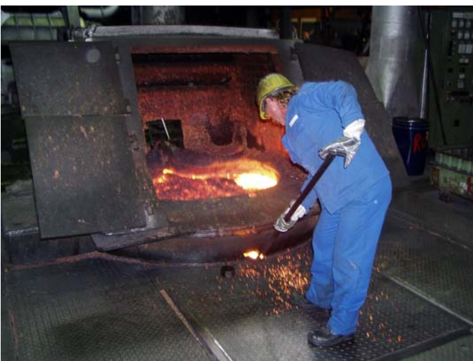
Figure 1: Exposure to radiant heat at a metal smelting furnace